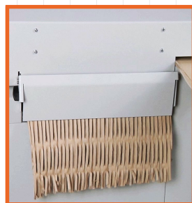
ADJUSTABLE CUSHIONING VOLUME of hard carton