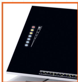
TOUCH SCREEN PANEL with LED Load Meter

OPTIONAL DUST COLLECTION SYSTEM to provide dust free padding mats for clean packaging.