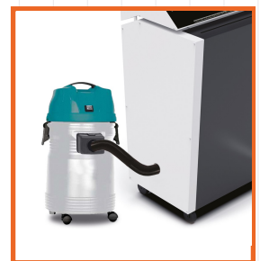
OPTIONAL COMPLETE DUST COLLECTION SYSTEM to provide dust free padding mats