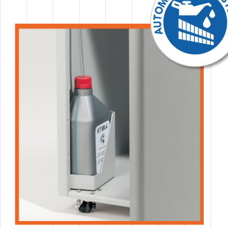
AUTOMATIC OILING SYSTEM

Motor thermal protection. Continuous duty motor, no overheating and no duty cycles. Integrated flap for CDs, DVDs, and credit card shredding