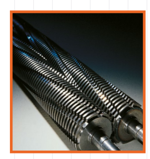
CARBON HARDENED STEEL CUTTING KNIVES unaffected by staples and clips