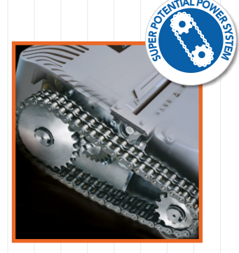
SUPER POTENTIAL POWER SYSTEM heavy duty chain drive system with steel gears

Automatically lubricates the cutting knives during the shredding operation, ensuring maximum reliability, efficiency and capacity