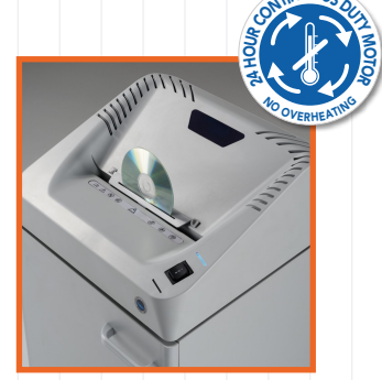
24 HR CONTINUOUS DUTY MOTOR

Motor thermal protection. Continuous duty motor, no overheating and no duty cycles. Integrated flap for CDs, DVDs, and credit card shredding