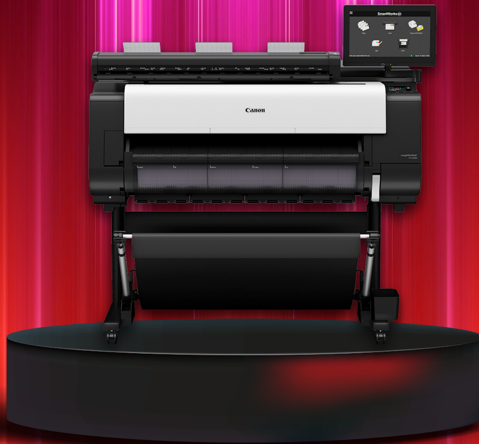
imagePROGRAF TX-3200 MFP Z36