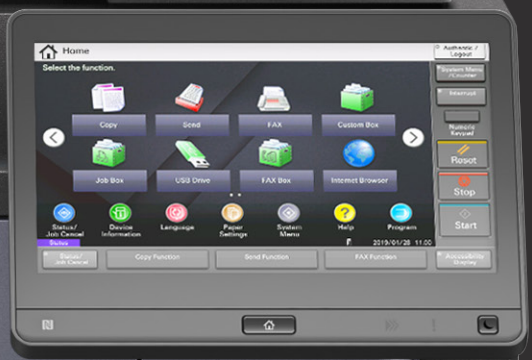
TASKalfa 9003i / 8003i / 7003i