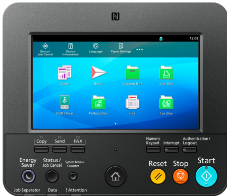
TASKalfa 508ci / 408ci / 358ci control panel